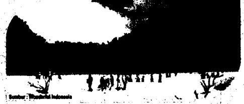
White Crater, Bandung