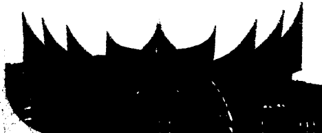
Rumah Gadang, Padang