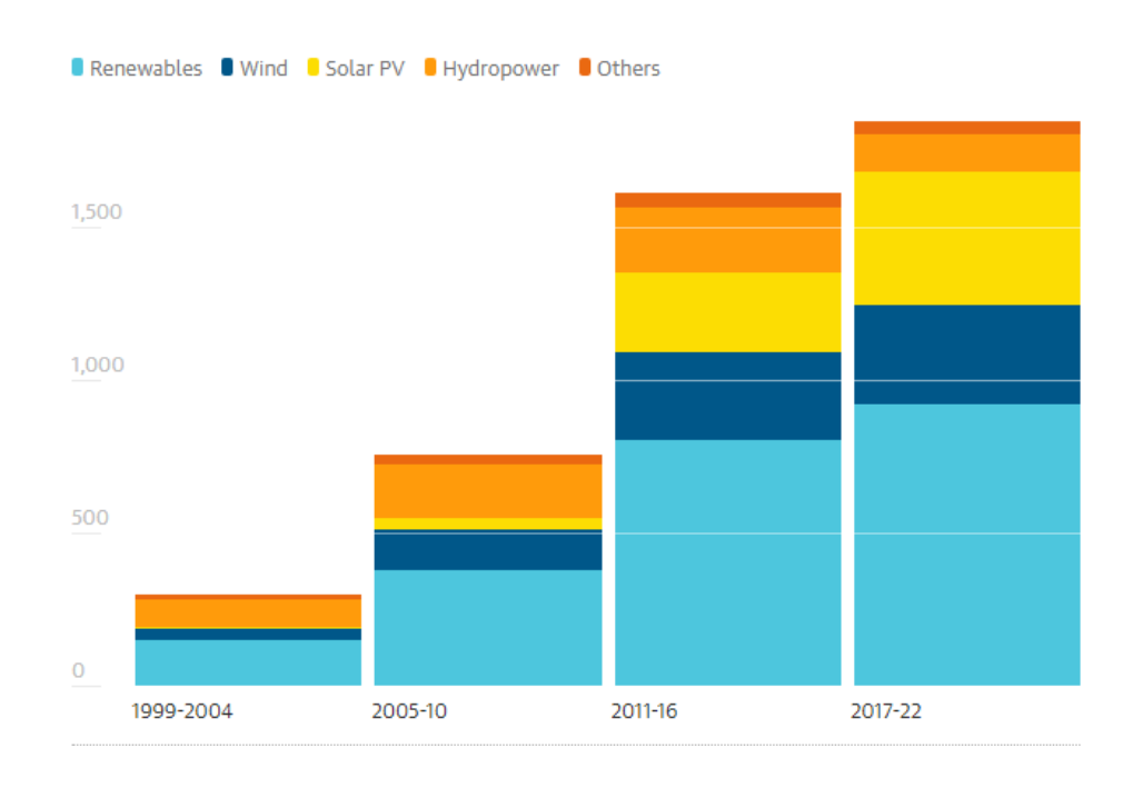
Table 6: Solar power will dominate growth in the following five years.

Solar power was the fastest-developing source of new energy universal frame past year, outstripping the development in total other forms of power generation for the first time and guiding specialists to hail a "new era" (Table 6).