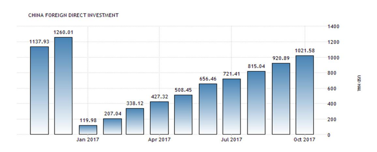
Table 2. Chinese Foreign Direct Investment, bln $, 2017

for a country that 10 years ago reported for less than 2 percent. In motive, combinations and obtainings by Chinese firms in 2016 achieved $140 billion in finished transactions—second only to those of US firms.