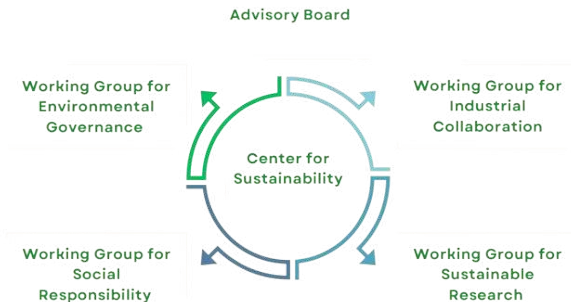
Figure 1. Governance Structure of Sustainability at UNEC

Working Group for Sustainable Research: The sustainable research working group encourages and supports research initiatives that address sustainability challenges. It promotes interdisciplinary research and facilitates the dissemination of knowledge for sustainable development